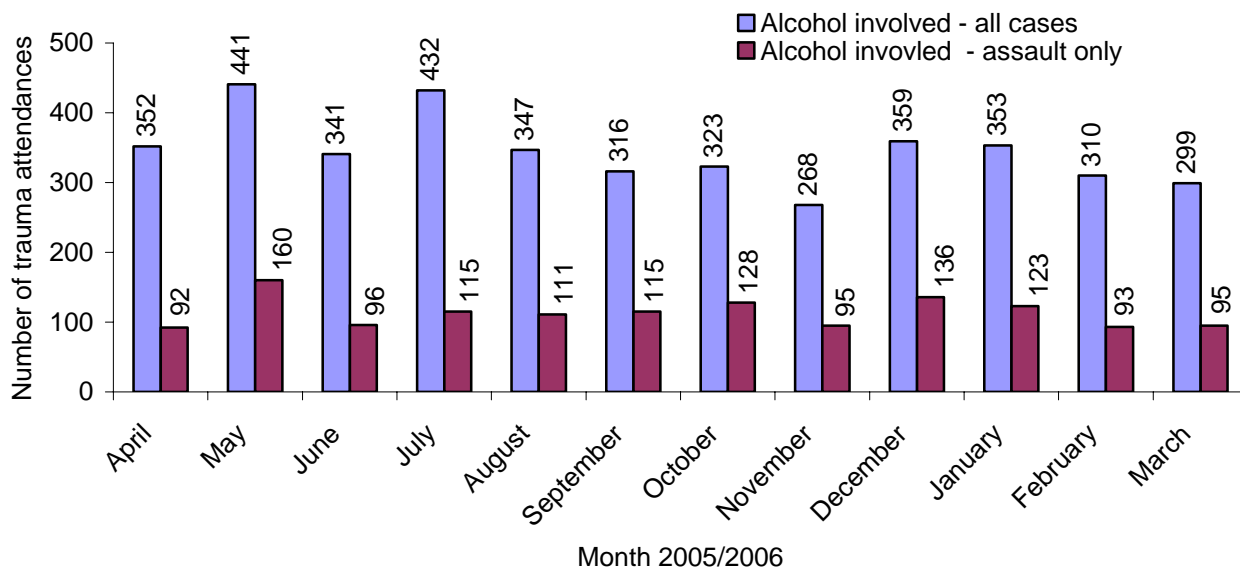
Figure 4: Alcohol related trauma attendance, all trauma and assaults only, April 2005 to March 2006

Table 6 shows the disposal method of trauma attendances. The majority (88%) of trauma attendances were discharged after treatment.