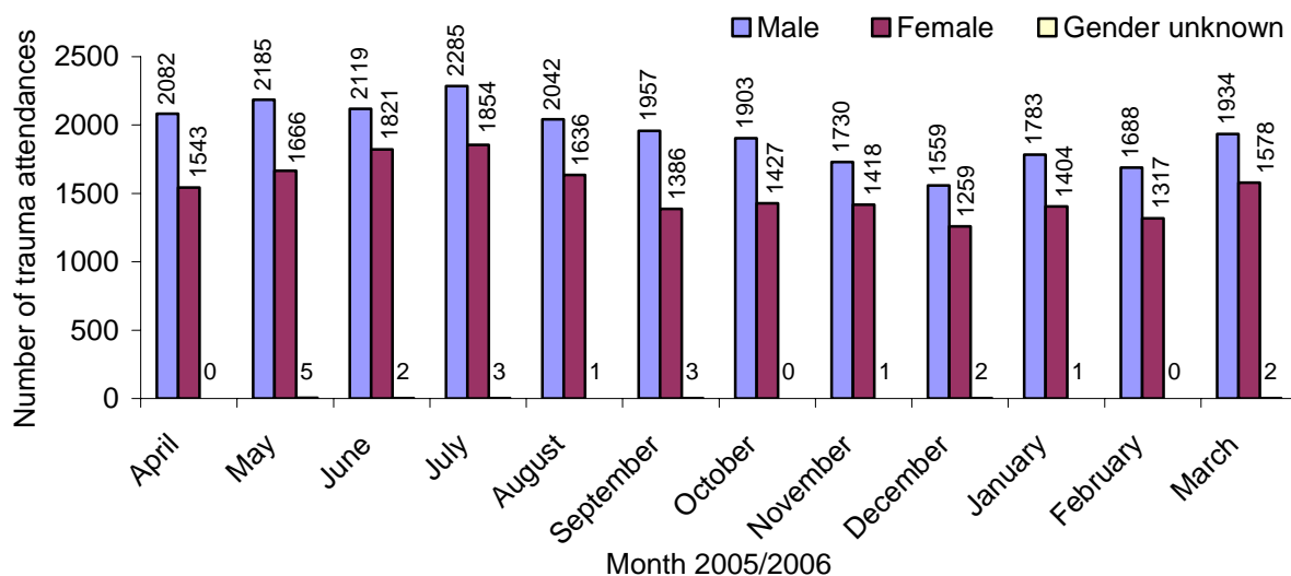
Figure 2: Gender of trauma attendances by month, April 2005 to March 2006

Figure 2 illustrates trauma attendances by gender. For all months there were more male trauma attendances than female presenting at Arrowe Park A&E department.